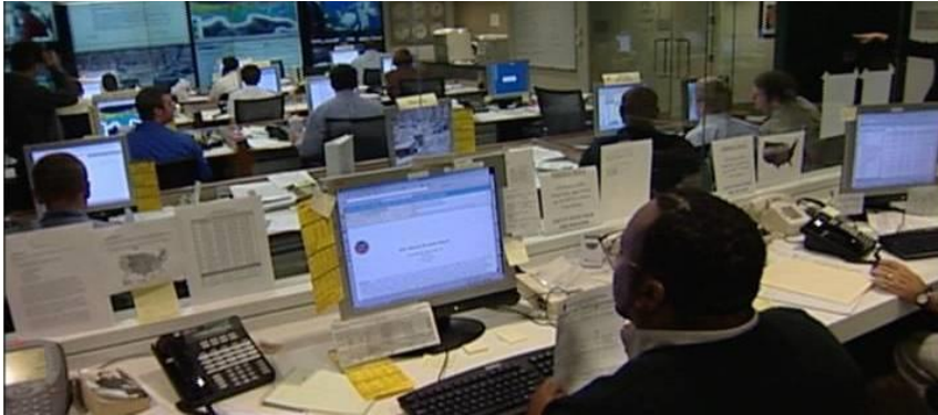
EPA Emergency Operations Center